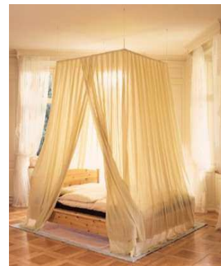
Bed Canopy made from Swiss Shield fabric to block out Microwave Radiation.

3. Nutrition & Lifestyle – The body requires ample nutrients and hydration to deal with this stress. This is best done with high quality supplements and good diet. Our office is using a few special products to help clients maintain optimum levels of cellular nutrients.