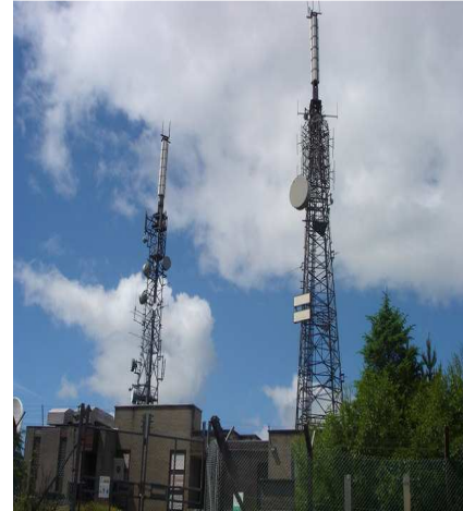
Digital TV and Radio Transmission Towers

As an example, from our office in Livonia, we are on average 12 miles from 7 of the broadcast towers. This is a relatively short distance from numerous towers and exposure to a sudden increase in unnatural, man-made microwave radiation. According to several prominent physicians in Germany, they found that people were experiencing health problems from only 2 digital TV transmitter towers over a 20 Km radius (over 12 miles). But again, if you can receive a signal you are being exposed to radiation, regardless of distance. When we take into account the significant number of local stations, all at full strength, at the same time, in more or less the center of the Metro Detroit area where most of the population will be in close proximity, then we have a true cause for concern. This is ultimately the crux of the Digital TV problem from the health and biological perspective.